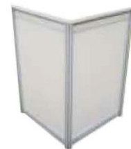
Display cube Code: PX-06 535(L)X535(W)X760(H)