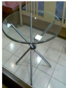
Round table Code: TR-01 850(D)X760(H)