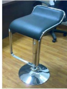
Barstool Code: BF-02 420(W)X400(D)X820(H)