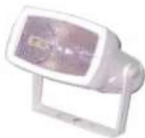
Metal halide 70w/150w Code: LE-08