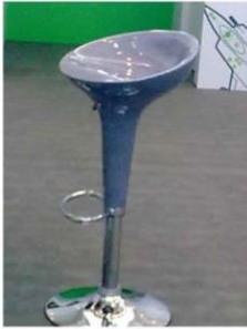
Barstool Code: BF-01 440(W)X480(D)X820(H)