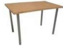
Meeting table Code: TF-02 1200(L)X900(W)X760(H)