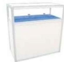
Small showcase Code: PX-02 1030(L)X535(W)X1030(H)