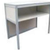
Information counter Code: PX-01 1030(L)X535(W)X760(H)