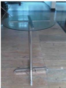
Cocktail table Code: TF-04 600(D)X1075(H)