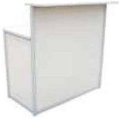
2-tier information counter Code: PX-07 1030(L)X535(W)X1030(H)