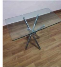
Coffee table Code: TF-01 450(W)X350(D)