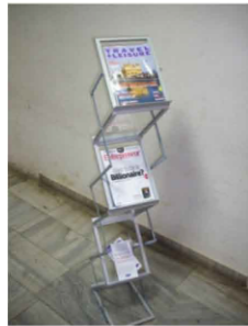
Brochure rack Code: AF-01 300(L)X300(W)X1100(H)