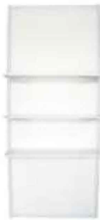
Shelf flat/ sloping Code: DS-01 1000(L)X300(W)