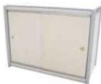
Lockable cupboard Code: PX-03 1030(L)X535(W)X760(H)