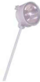
150W long arm helogen Code: LE-02