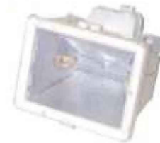
300W helogen flood light Code: LE-07